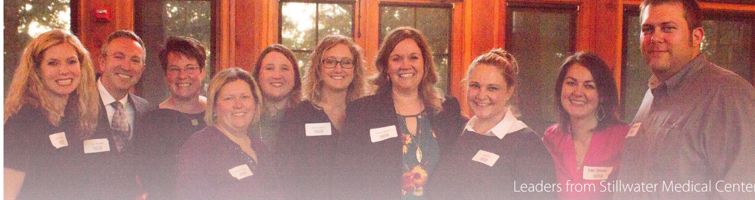
Leaders from Stillwater Medical Center